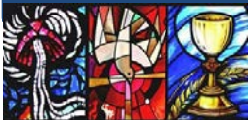
OFFER, STRENGTHEN, SUSTAIN